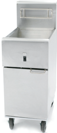
SR114E Shown with optional casters.